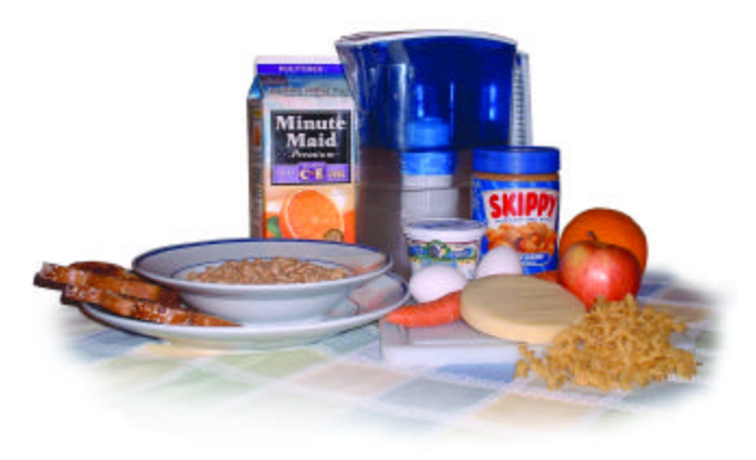
A healthy diet is important.

White flour mixed with water, as any school age child will know, turns into glue. Ingested, white flour turns into glue in the stomach. (Compare this result vs. mixing water with whole wheat flour. Glue is NOT formed.) The intestinal glue can clog up food absorption for a short while until it is broken down. And then it breaks down into sugar which gives energy for a short time, but then disappears, giving the eater a hypoglycemic "let down".